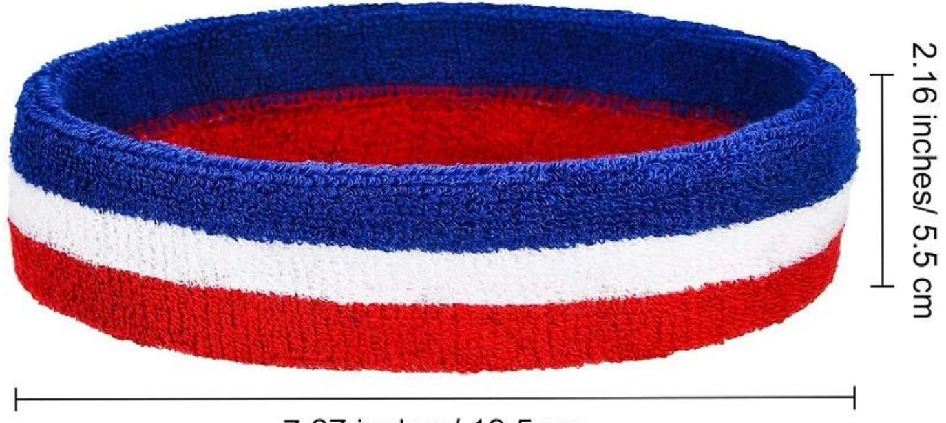
7.67 inches/ 19.5 cm