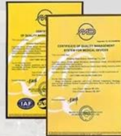
ISO 9001/ISO 13485