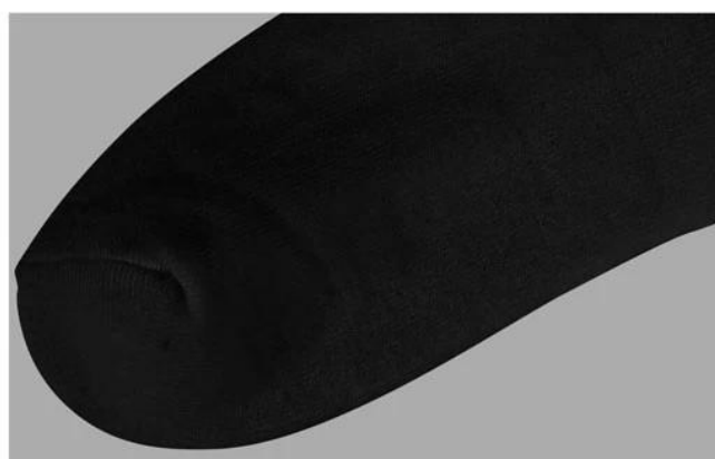
Manual Sewing Head