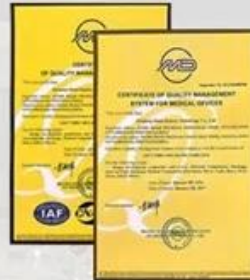
ISO 9001/ISO 13485