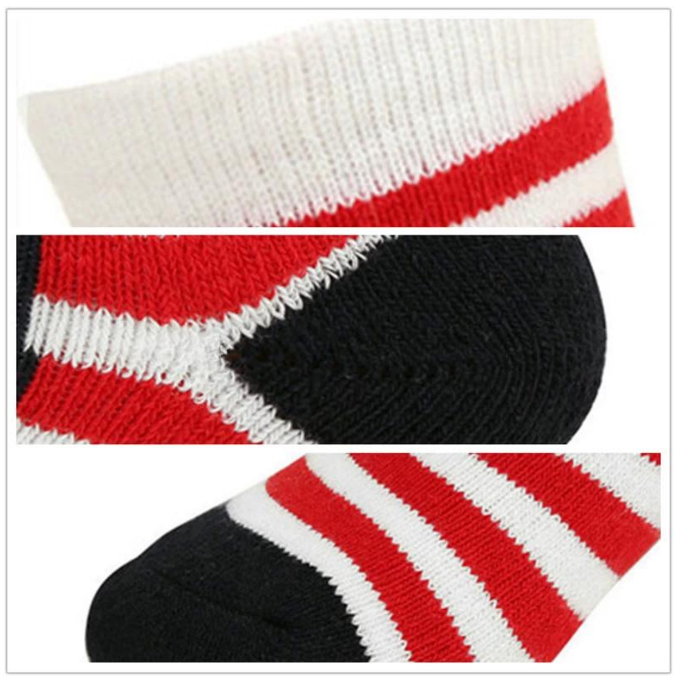
Function and Features