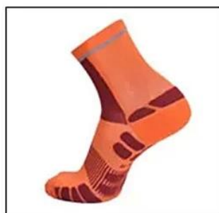
Product Picture or Artwork