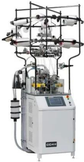
Germany MERZ Medical Grade Compression