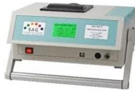
Swiss MST Compression Testing Equipment