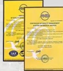
ISO 9001/ISO 13485