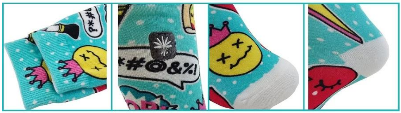
If you want to get more information about 3D digital print socks, you can